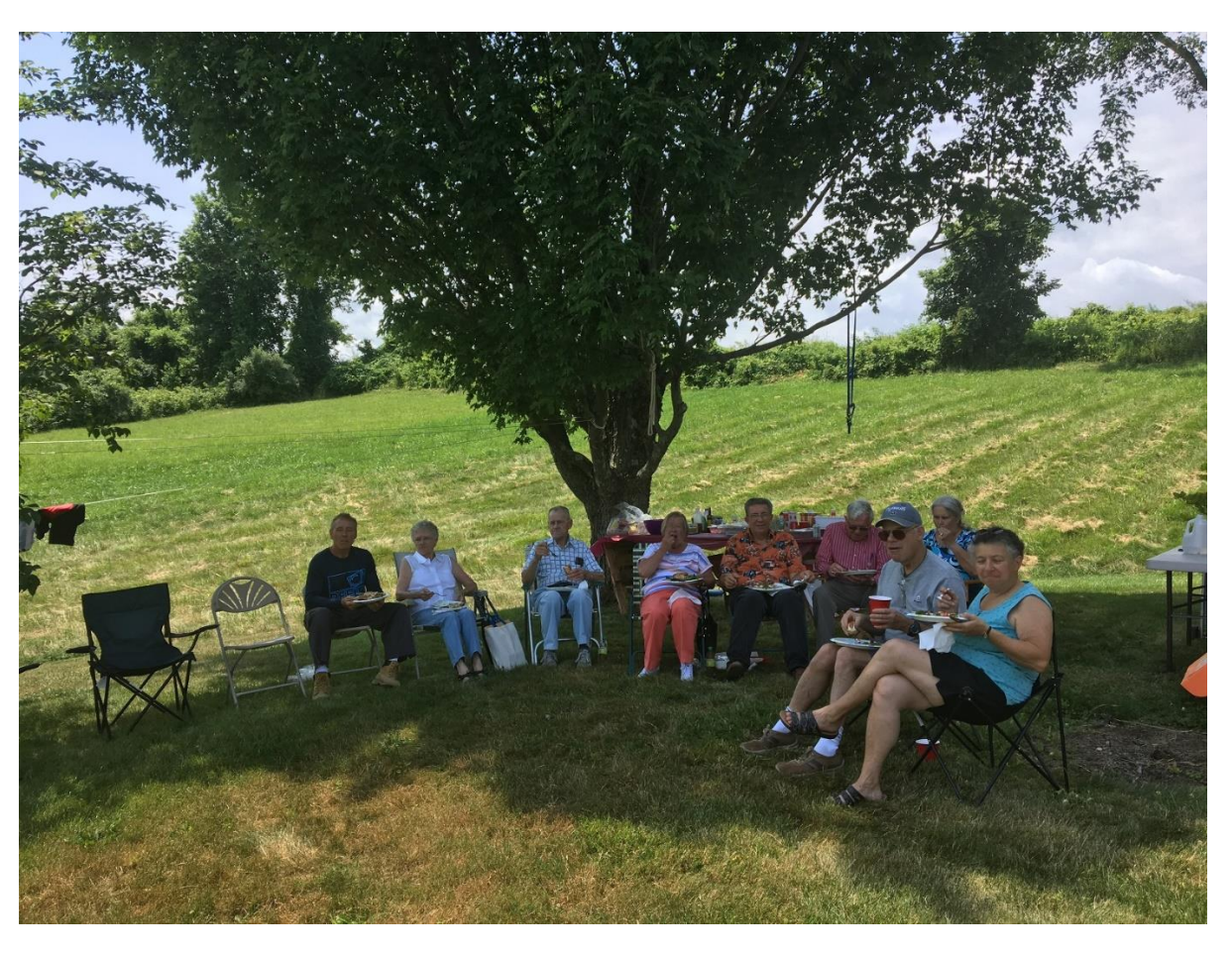
A whole lot of touring was on the mind of the Region has they enjoyed the spot:

The Region stayed cool in the shade of the same tree also while surrounded by all the field that Jim had cut: