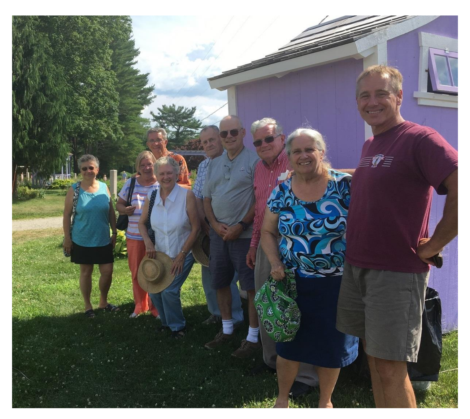
This was a nice touring day in a rural area with great weather, great food, and Region member stories covering time since our last meeting.

The day ended with the typical trip to the ice cream parlor where the Region put on the smiles after polishing off the ice cream with cows in the nearby dairy fields: