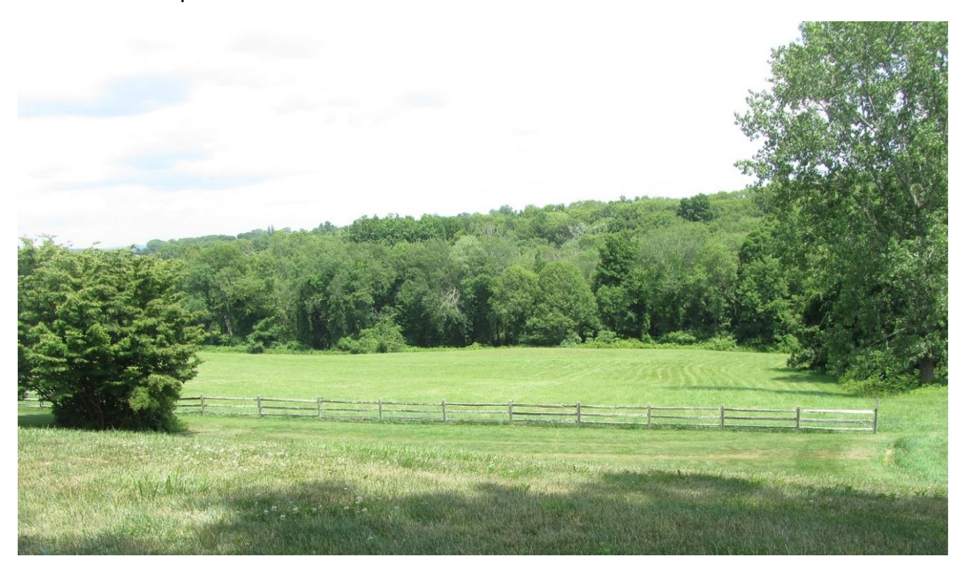
The lunch and meeting also had a fantastic view:

Cars also were parked in a location where there was a fantastic view: