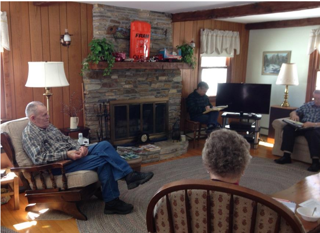
Fram Clock Awaits Arrival Of Participants

The sun was setting as the last of the members left with their memories & pictures of the day's events. At least the road conditions were fine for the drive home to round out a perfectly great time.