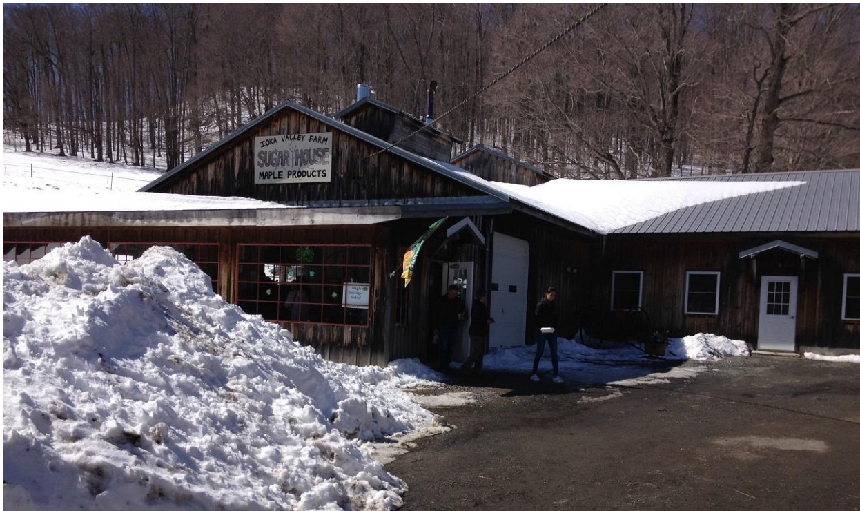
IOKA Sugar House Tour Available To Breakfast Guests

Two Belgian buttermilk waffles topped with ice cream, our own homemade strawberry sauce, and whipped cream. Also includes 3 bacon or 2 sausage, homemade applesauce, three mini corn muffins w/ maple butter.....$14.95