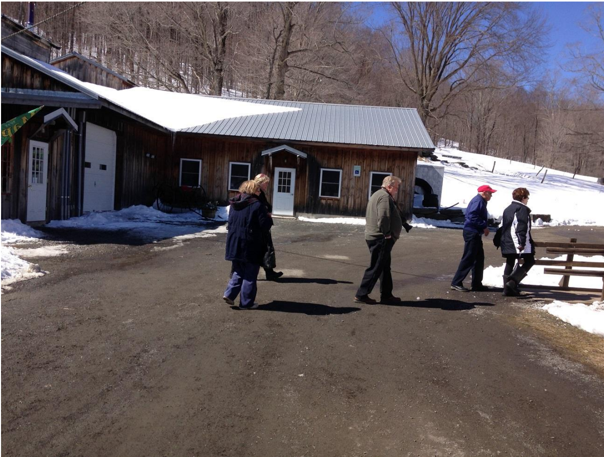
Breakfast At IOKA Serves Up Colonial Region