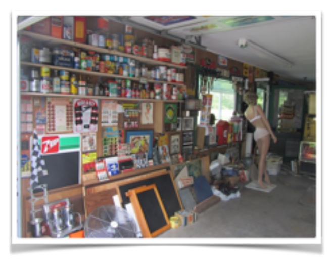
There were other places to look at the center of the old fashioned garage.