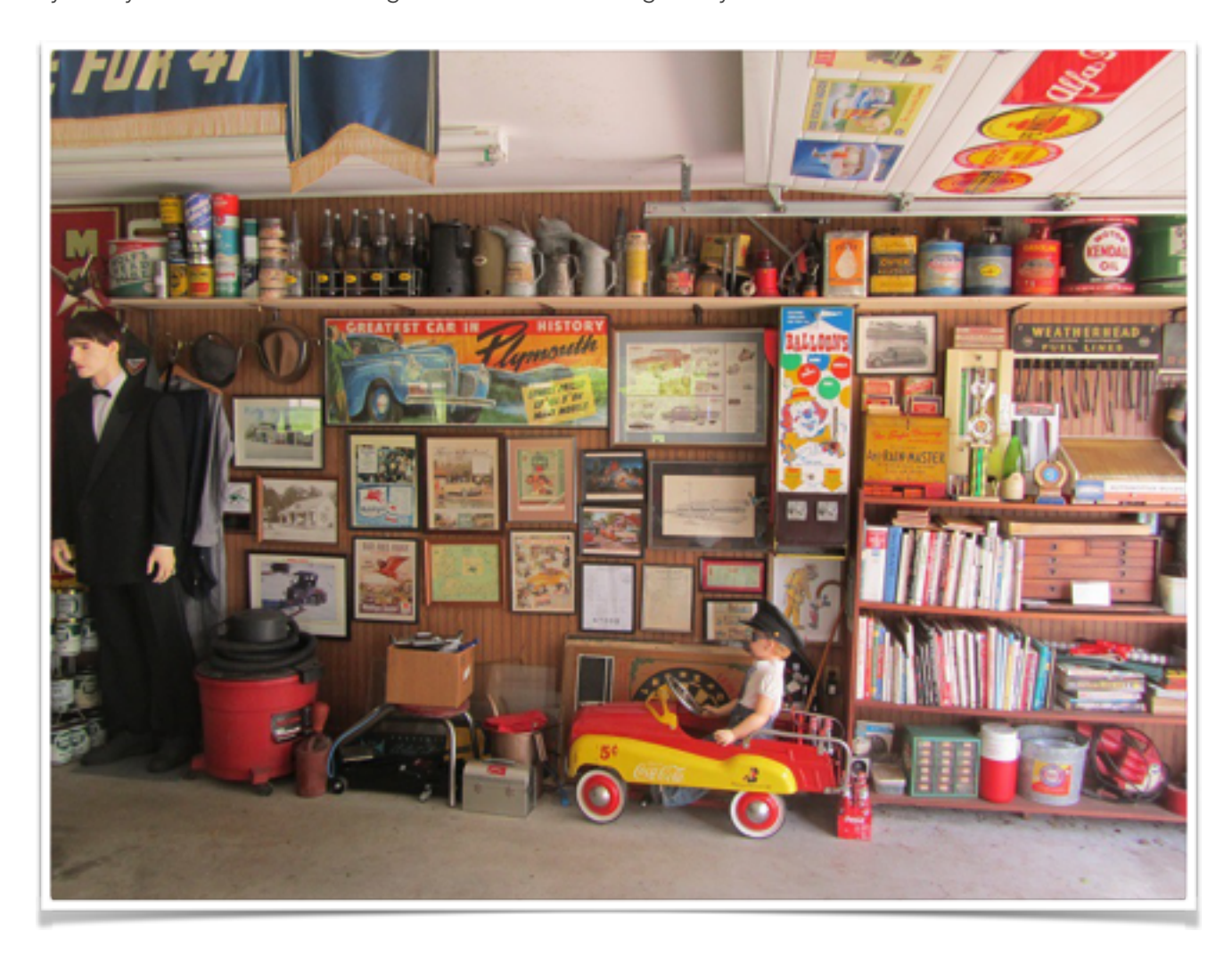
If your Plymouth needed servicing then the other wall might be your desire?